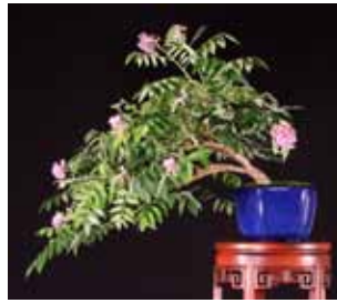
Amethyst Falls Wisteria Wisteria frutescens 'Amethyst Falls'

Amethyst Falls wisteria is a select cultivar of an American native species. This Wisteria is not as invasive as the common Chinese wisteria and blossoms throughout the summer, not only in spring. The flower buds first appear as an attractive grape-like cluster that open on short racemes with violet/blue flowers that form on very young plants. Plants are cutting grown to avoid ugly graft unions and have bloomed repeatedly throughout most of the summer. Extend your Wisteria blossoming bonsai throughout the summer!