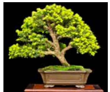
Little Gem Dwarf Spruce Picea abies 'Little Gem'

PRE-BONSAI- FROM 4" POT 8-10" TALL- $20 FREE SHIPPING