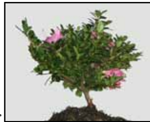
Momo No Haru Satsuki Azalea Rhododendron indicum 'Momo No Haru'

BRANCHED PLANT FROM 4" POT- 4-6" TALL- $15 FREE SHIPPING