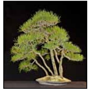
Japanese Red Pine Pinus densiflora

PRE-BONSAI- FROM 1 GAL. 10-14" TALL- $45 FREE SHIPPING