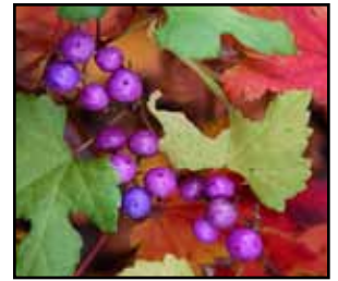
Porcelain Berry Ampelopsis brevipedunculata

5 TREE BAREROOT SEEDLING BUNDLE- 4-8" TALL- $20 FREE SHIPPING