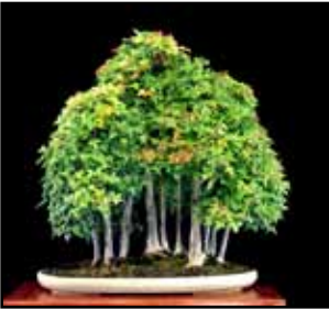
Trident Maple Acer buergerianum

PRE-BONSAI- FROM 3 GAL. 10-14" TALL- $110 FREE SHIPPING 5 TREE BAREROOT SEEDLING BUNDLE- 4-8" TALL- $20 FREE SHIPPING