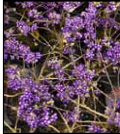
Early Amethyst Beautyberry Callicarpa dichotoma 'Early Amethyst'

PRE-BONSAI- FROM 1 GAL. 10-14" TALL- $30 FREE SHIPPING