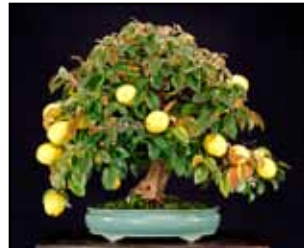
Chinese Quince Pseudocydonia sinensis

The Chinese Quince, "King of Fruiting Bonsai" is a distinctive species because of its attractive pink flowers in spring and large fruit during the summer. In autumn the fragrant fruit mature to a golden yellow and the foliage turns orange and red. Irregular patches of colorful bark peel away during the growing season which can be best appreciated in the winter. All plants are seedlings from one of our bonsai and were grown in small pots and now have excellent roots. The thin trunks can easily be wired into interesting shapes or created into a forest bonsai. Chinese quince has it all- flowers, fruit, bark and autumn color.