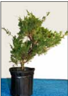
Sargent Juniper Juniperus chinensis 'Shimpaku'

10 TREE BAREROOT SEEDLING BUNDLE- 6-18" TALL- $35 FREE SHIPPING