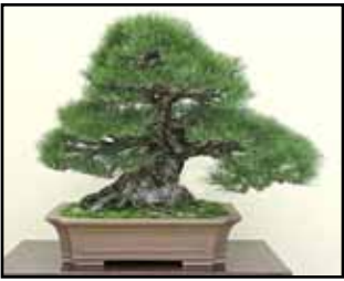
Mikawa Japanese Black Pine Pinus thunbergi var. Mikawa

The Japanese black pine is one of the finest and easiest pine species to train for bonsai. They are vigorous with dark green needles which will quickly reduce in size. The pre-bonsai are container grown and have trunks (about 2") with a lovely gentle movement and branches. The rough bark is beginning to develop on the well shaped trunks. These pre-bonsai Japanese black pine are ready for serious development into fine bonsai and ready for display containers. The bareroot seedlings are unbranched and great for shaping into any design.