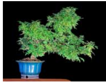
Dwarf Wisteria Millettia japonica

PRE-BONSAI- FROM 1 GAL. 8-12" TALL- $25 FREE SHIPPING