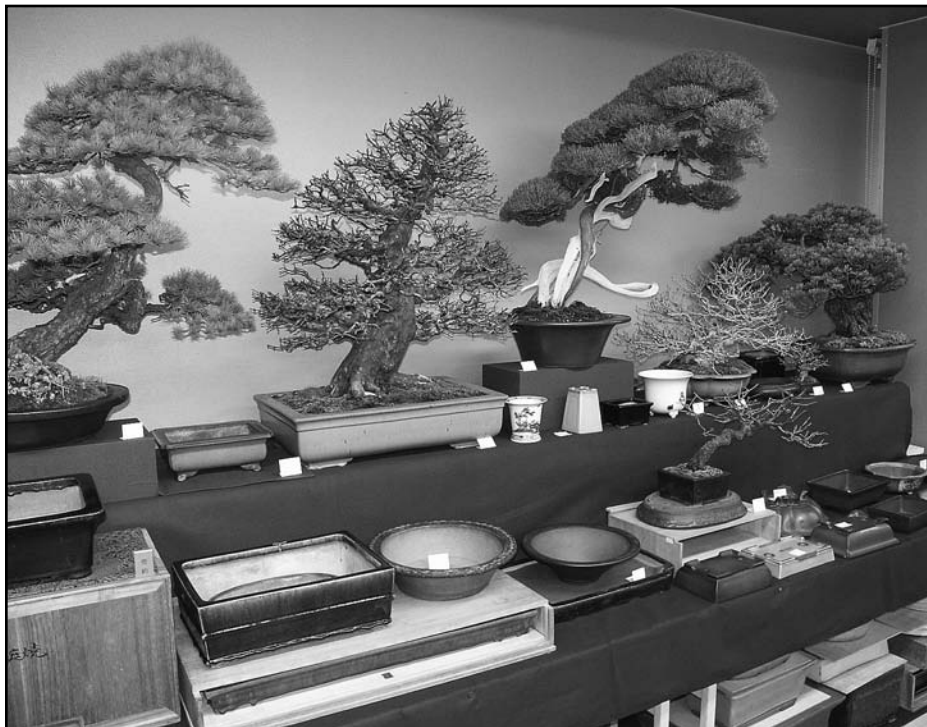
The three floors of the Ueno Green Club are full of masterpiece bonsai, antique containers, books, tools, suiseki, scrolls and other artifacts for bonsai creation and enjoyment.