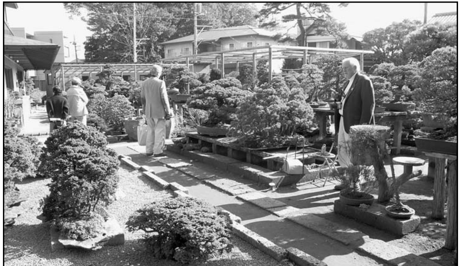
Tour members studying the bonsai and rock plantings at the Mansei-en Bonsai Garden of the Kato family in Omiya Bonsai Village, Japan.