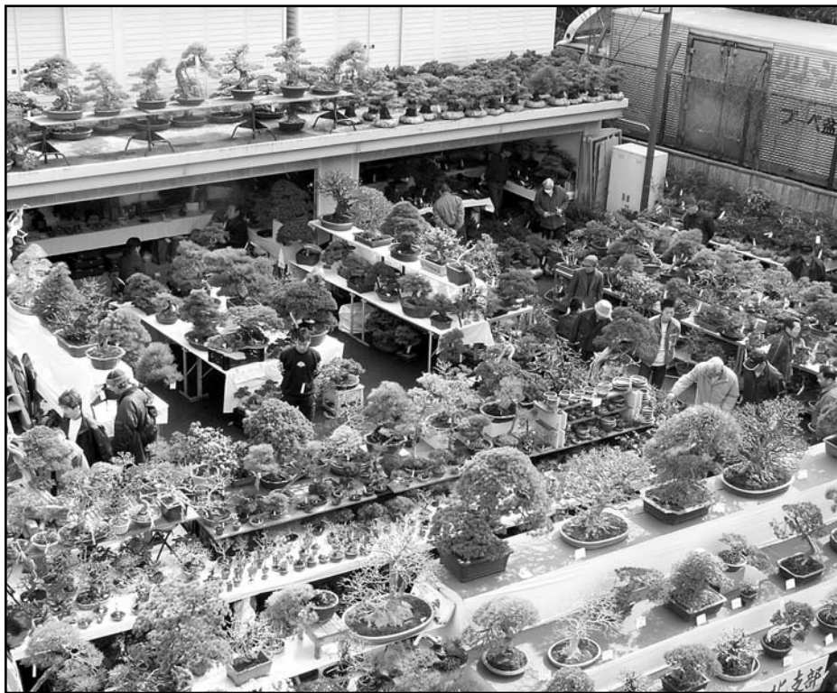
At the outdoor sales area of the Ueno Green Club bonsai, prebonsai, containers, tools, soil and seeds can be found for sale. Note many of the large size bonsai on the roof are sold as bare-root specimens.

Juniper bonsai being airlayered at the bonsai garden of Masahiko Kimura where training techniques can easily be studied.