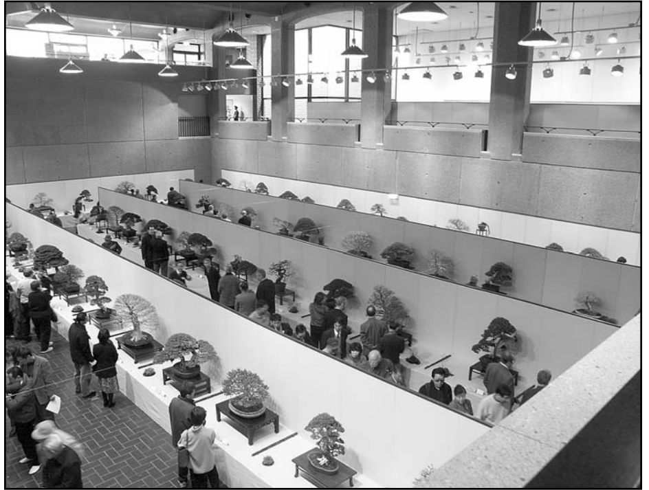
Balcony view of one of the four rooms at the National Bonsai Exhibition held in the Tokyo Metropolitan Art Museum. This room has large size bonsai while the room on the upper left has medium size bonsai.

Since exhibitions and vendor areas are usually held simultaneously, I will use my approach to the Japan National Bonsai Exhibition and the Ueno Green Club vendor area as a suggested way to extract the maximum